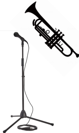
Andy Trumpet and optional vox