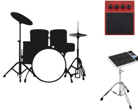
Higgi V drums or acoustic drums Octapad and sampler